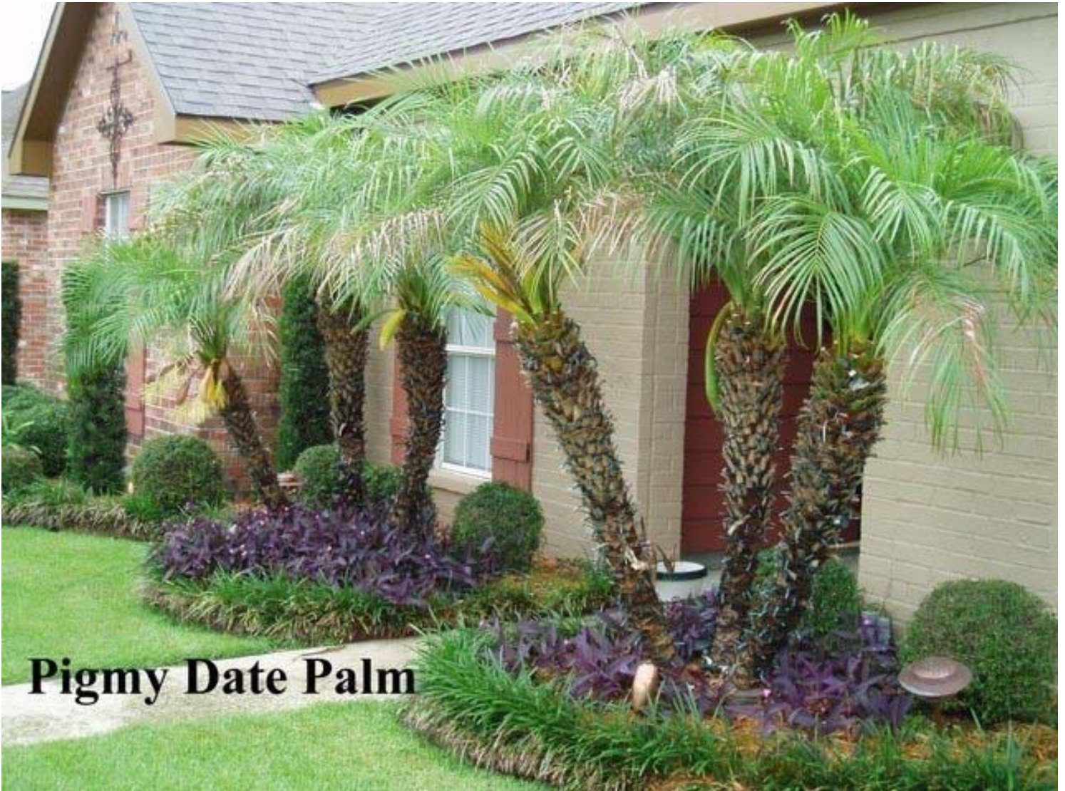
Pigmy Date Palm

9. Phoenix Roebelenii Palm - very sharp long painful thorns - trim carefully from the bottom wearing gloves