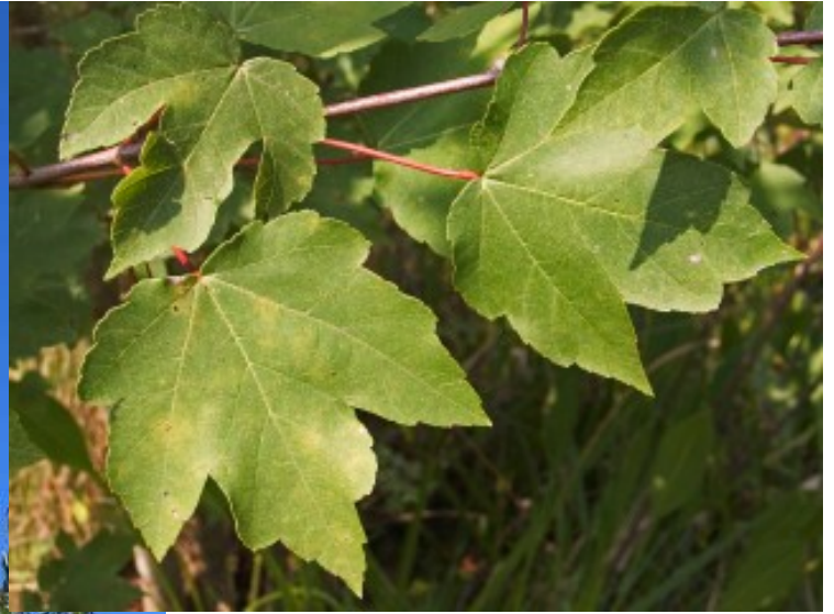
Branches grow up.