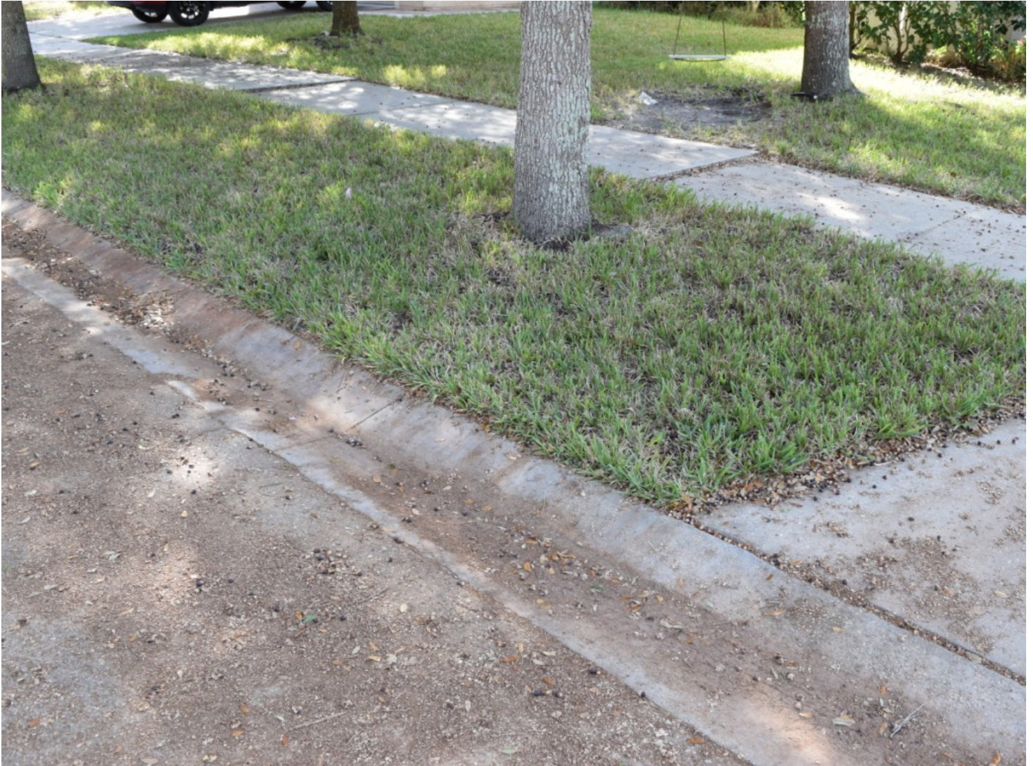
Mess & stain caused by crushed Oak tree acorns.