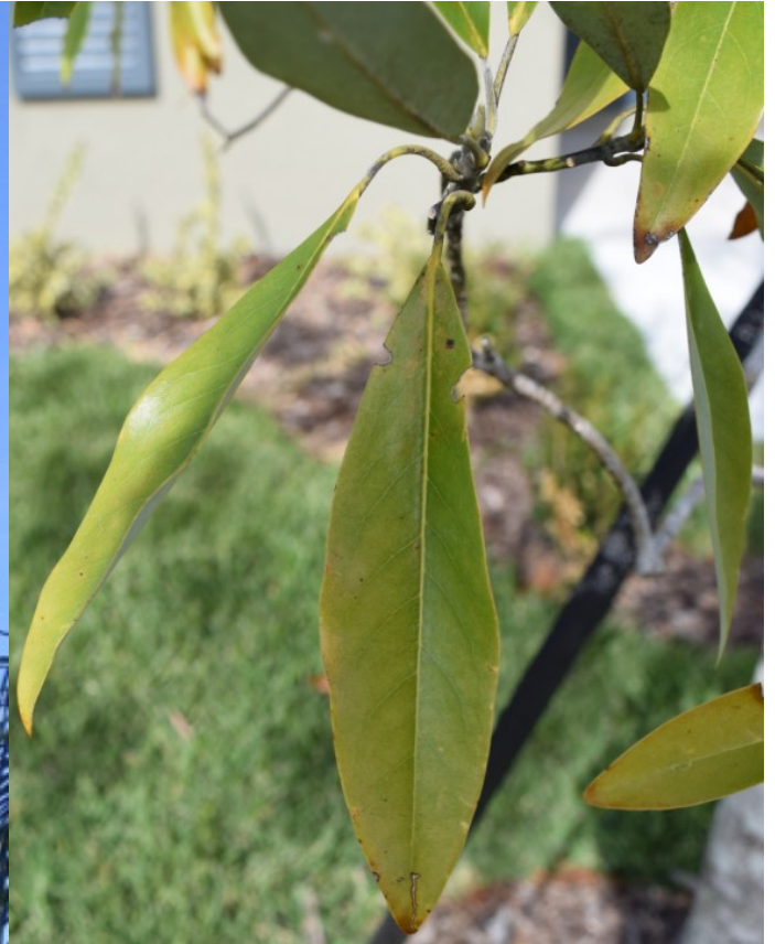
Branches grow sideways & up.