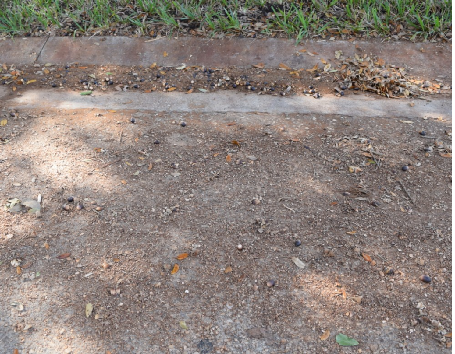
Car tires grind the Oak tree acorns into this red staining powdery mess.