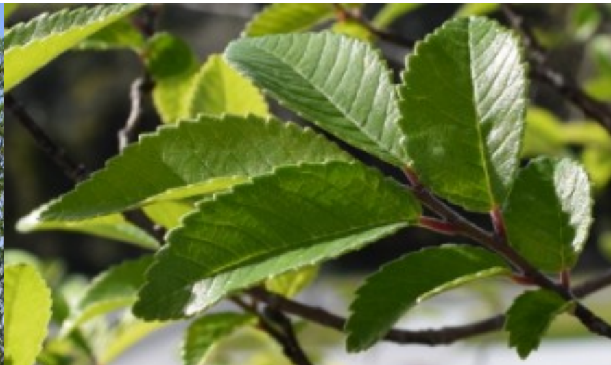
Branches grow up.