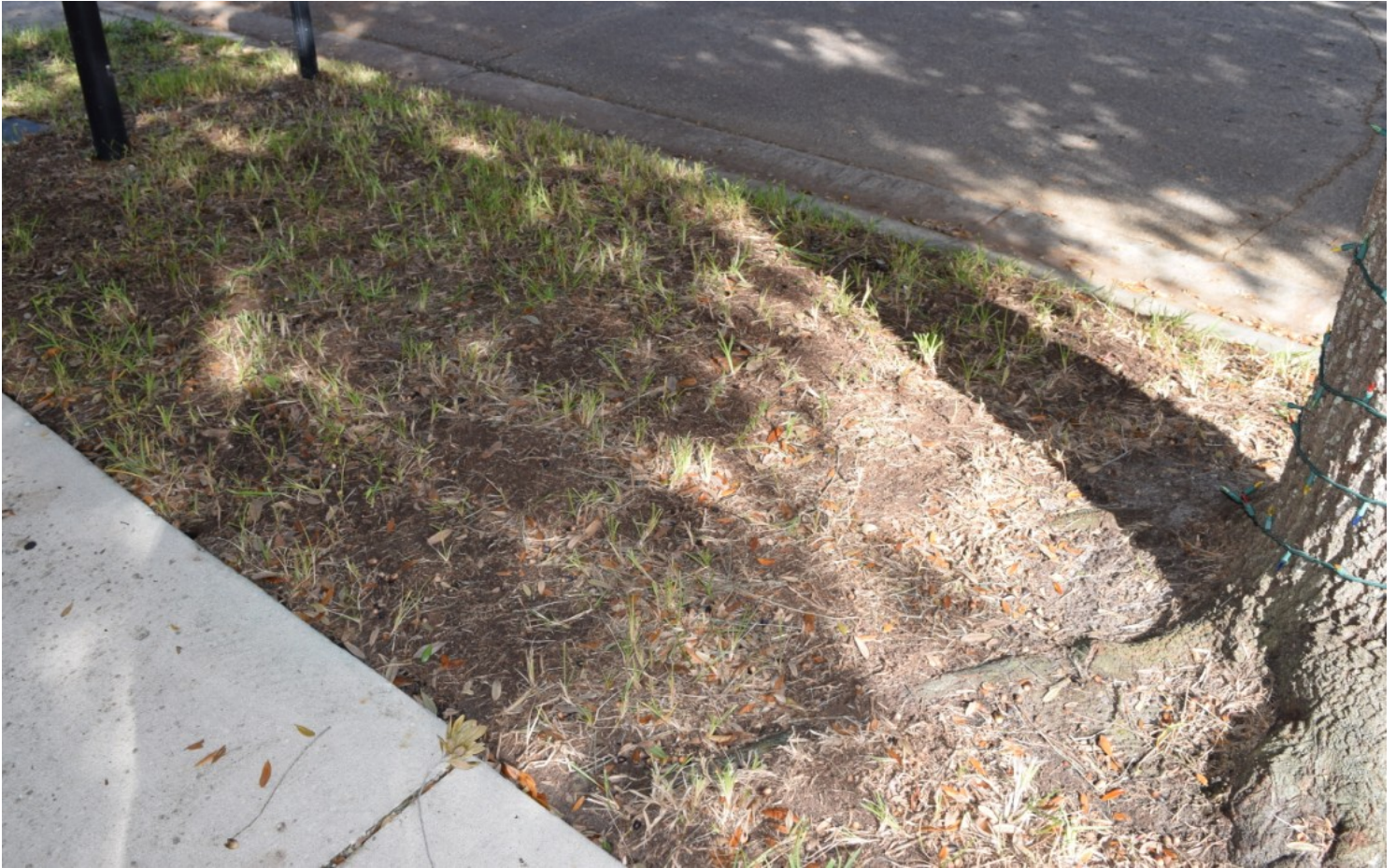
The 4 trees from the previous page have smothered the grass from sunlight, causing sparse, ugly & sandy lawn.