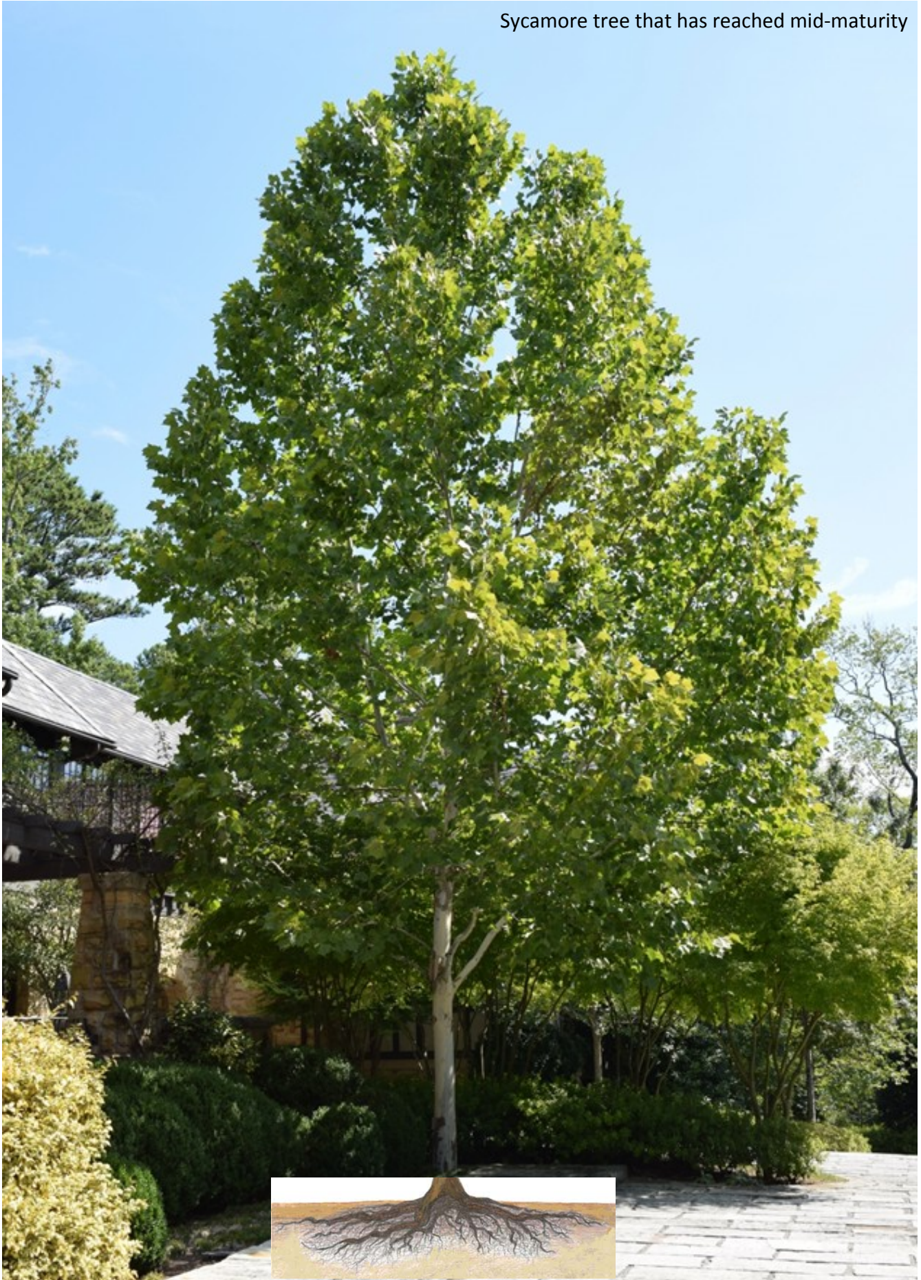
Sycamore tree that has reached mid-maturity

1b. Sycamore Tree - grows 60' tall with spreading roots & 10,000's of large leaves to rake-up in Winter